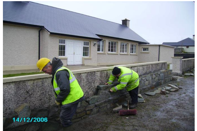
Balla cloch ag Inbhear