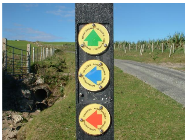
Siúlóidí Ceathrú Thaidhg – Lean an saighead