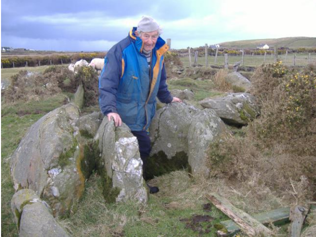
Tuama meigiliteach i nGort Breac

Bharr na dTonn', siúlóid oidhreacht, ceol, amhránaíocht, damhsa agus biongo mór. Ba iad Cumann Lúthchleas Gael Chill Chomáin, Comhar Dún Chaocháin Teo agus Coiste Ghlor na nGael Ceathrú Thaidhg eagraithe na féile le gach brabach ag dul i dtreo Club na mBan agus Club na bhFear Chill Chomáin.