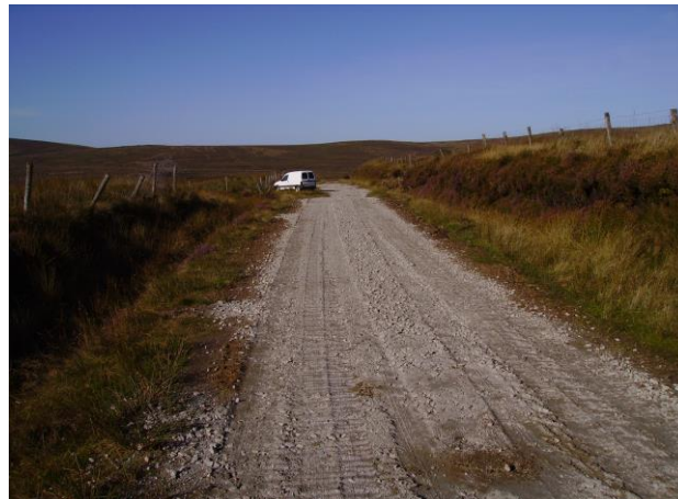
Bóthar Portaigh Bhaile na hAchadh

Tá tuilleadh eolais le fáil ó Phádraig Ó Dochartaigh (saoiste na scéime) ar 087 9785035